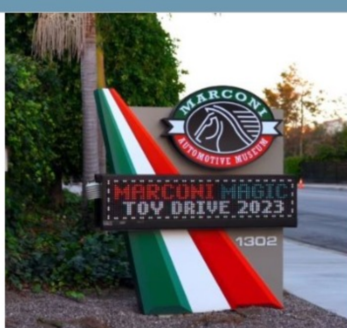
Thank you to the Marconi family for including us as a part of their Christmas toy drive.

The Marconi Foundation once again visits Mary's Path with a truck load of toys and gifts for our teen moms and babies.